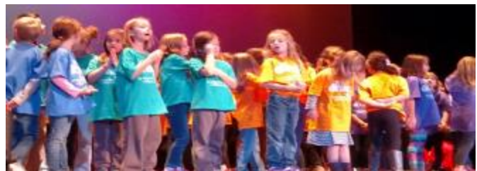
Our SPJ students performed wonderfully at HCA's drama club showcase on November 15 at the Palace Theatre in Canton! We are very proud of them!